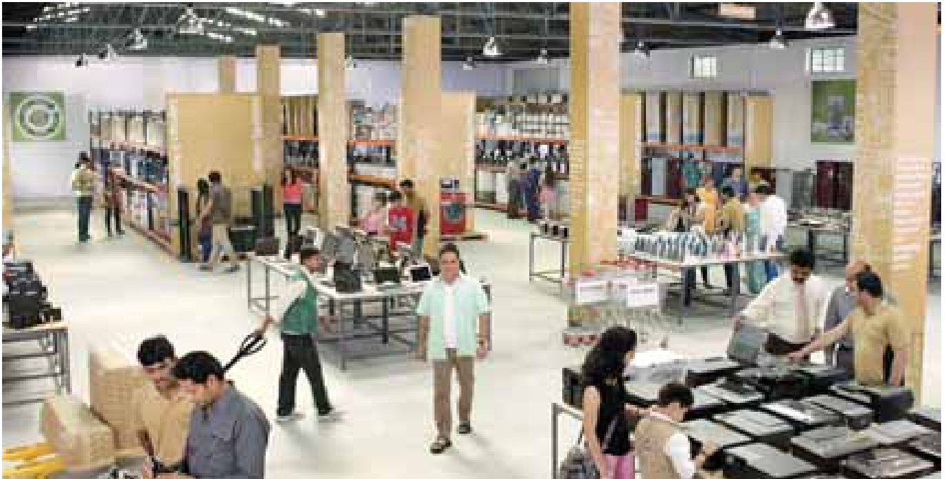
Reverse Logistics Company's biggest value-added centre is spread across almost 10,000 square feet in West Delhi.

In 2000, I was asked to join the management team of a US-based reverse logistics company. I met the founder, who asked me to define supply chain. After I gave him a dictionary definition of the term as 'the movement of goods, products, and services from the manufacturer to the consumer', he said I was only half right. What I had defined was forward supply chain, but what about a certain fraction or percentage of products that go through the reverse journey? He then said, "That is where we play, to help companies manage their returns."